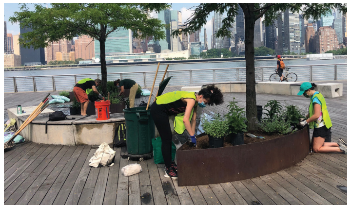
Volunteers in Hunter's Point South Park after removing 43 bags of weeds in one session - a new record!