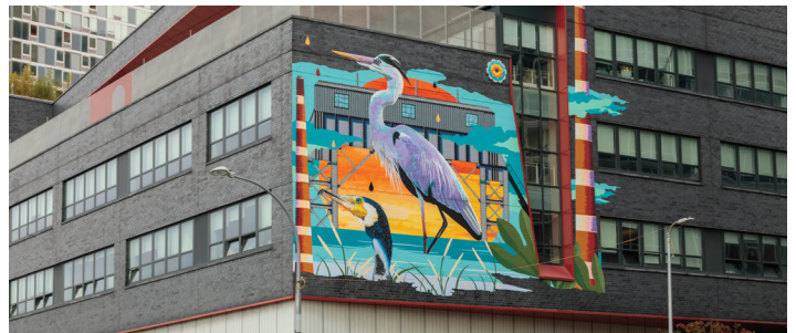
Iena Cruz's High Tide