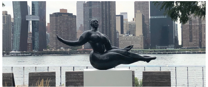
Gaston Lachaise's Floating Woman

HPPC also partnered in the creation of an equally remarkable piece - Iena Cruz's High Tide , a mural depicting the past, present and future of Newtown Creek. The mural was unveiled on October 21st when HPPC hosted local elected officials, educators, and environmental leaders at a press conference recognizing its completion. The mural is on the South wall of the Q404 Hunters Point campus building, which hosts the Hunters Point Community Middle School, The Academy for TV and Film and The Riverview School, and is directly across from the park. This project was led by Greenpoint Innovations and Newtown Creek Alliance.