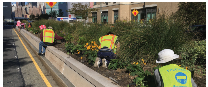
Volunteers working on the medians on 48th Ave.