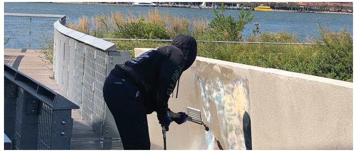
NYC Parks employee removing graffiti