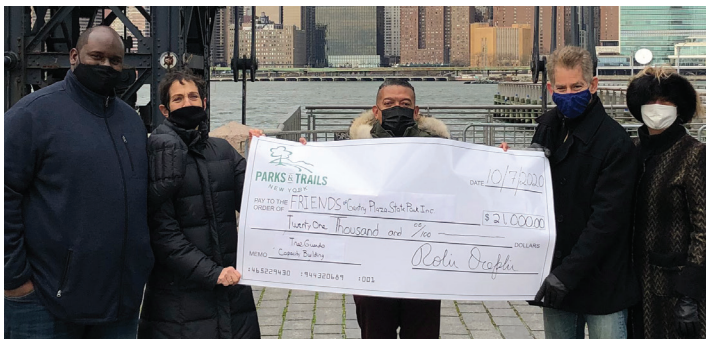
HPPC is presented with a check from Parks & Trails New York

HPPC continued to support horticulture projects in Gantry Plaza State Park, working closely with park management and a newly hired park horticulturist. We also purchased several hundred plants for the park that were planted with the help of our volunteers over the summer. In addition, the Conservancy was awarded a $21,600 grant from Parks & Trails New York to replace several worn and damaged tree guards - essential pieces of park infrastructure that protect trees from the harsh urban environment. The Conservancy will provide a 15% match for this grant, for a total project budget of $24,750.