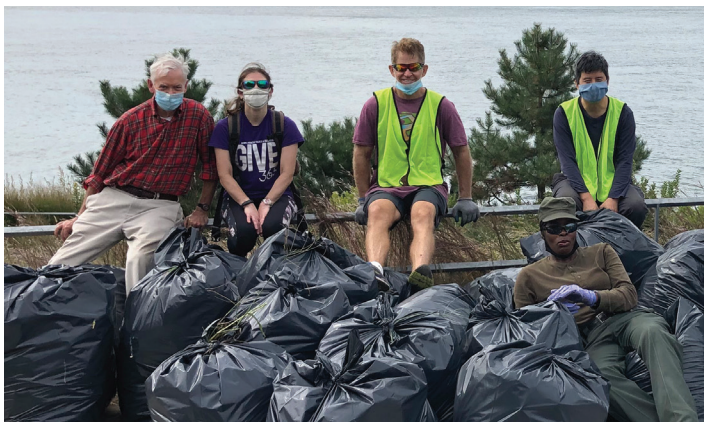
Volunteers in Hunter's Point South Park after removing 43 bags of weeds in one session