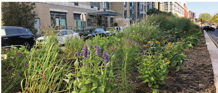
The completed pollinator garden

We can't wait to see the waterfront blooming with new life in Spring 2021!